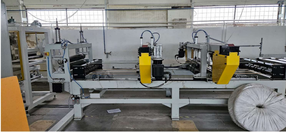
19. Length-side milling section