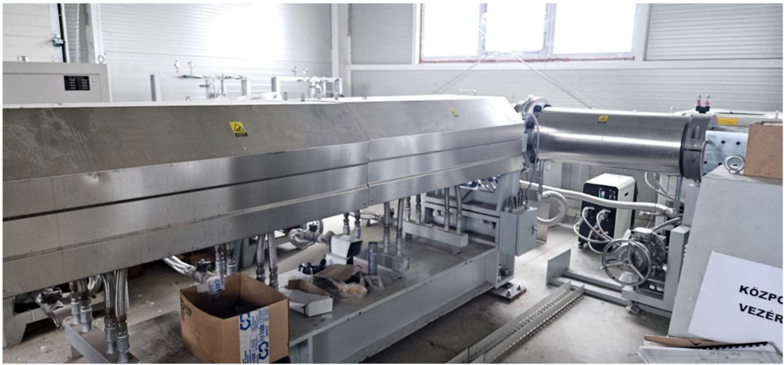
5. Dosing unit for SCF CO2